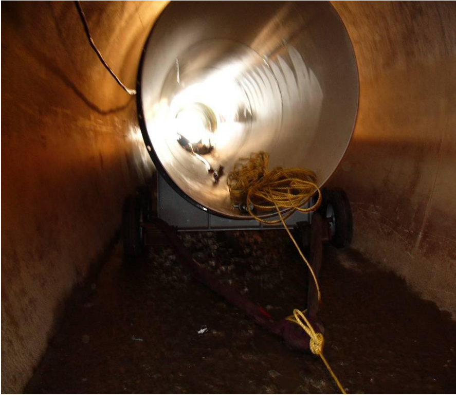
Penstock piping in the process of being winched up an existing tunnel. PFS design of temporary works.