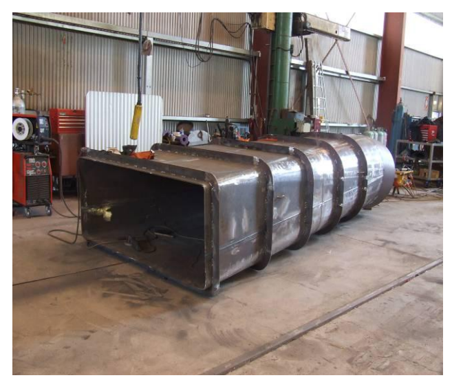
Outfall Transition – Rectangular to round transition.