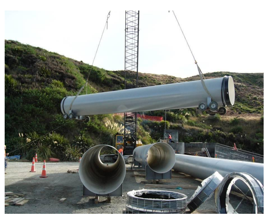
Penstock piping being lifted over the existing outfall channel ready to be pulled on the tunnel.

• Tunnel plug, penstock pipes, bifurcation and outfall transition during planned outage. Works presently in progress include underground penstock and structural steel within the powerhouse.