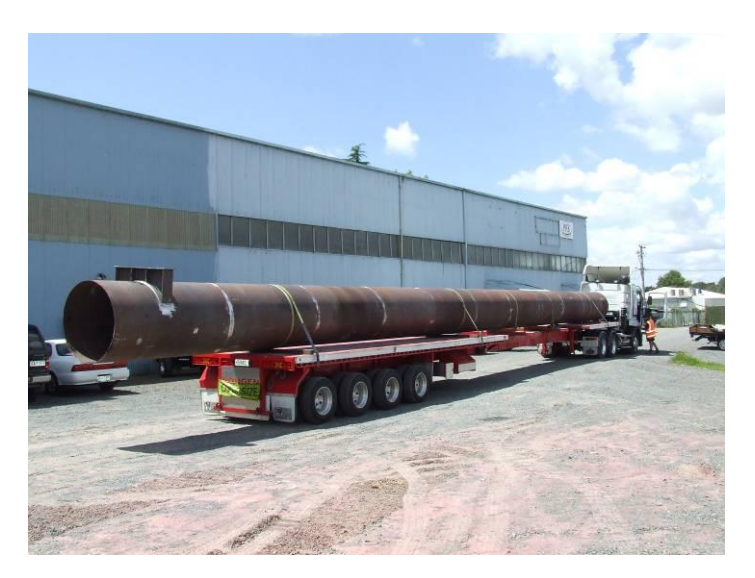
Penstock Piping ready for transport to the painters with Workshop in the background

Bifurcation – Complicated fabrication - Three way transition with two reducing lobster back bends to ASME B31.1, NDT Stress Relieving and Hydrotest all conducted at our workshop.